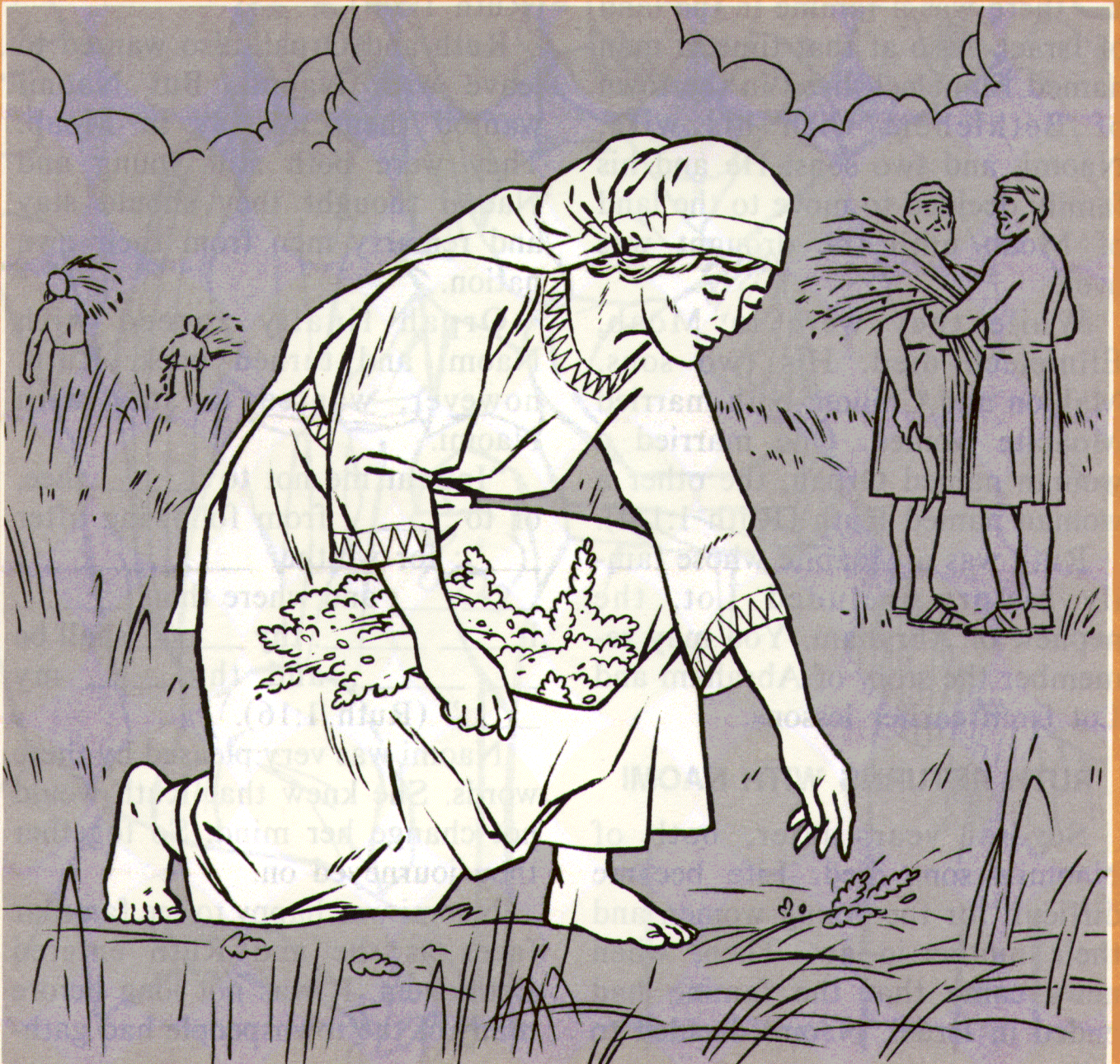
Ruth—A Virtuous Woman